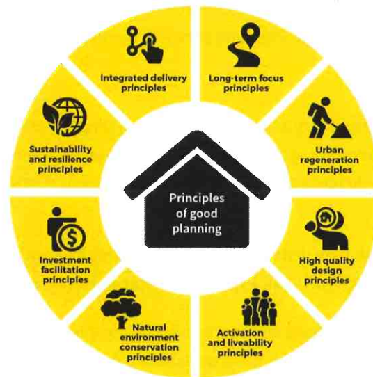
[Figure 1: ACT Government, Principles of good planning , 12 October 2022]

2.7. The ‘principles of good planning’ are outlined in Part 2.2 of the Bill and are set out in Figure 1 below.